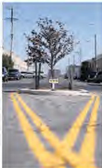
Pollution is to be dealt with, says the writing on the road.

The map, called CalEnviroScreen, used thousands of pieces of data to identify communities that bear a disproportionate share of various toxicants, from dirty air to hazardous waste facilities. The designations